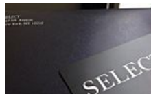
The Black Card That's Changing the Face of