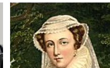
Do You Have Royal Blood? Your Last Name