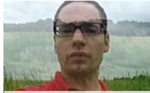
Decision Delayed On Country Music Festival