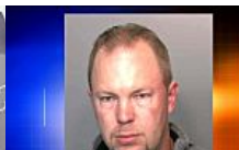
Selbyville Man Convicted of 11th DUI