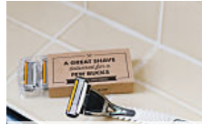
How This Razor is Disrupting a $13 Billion