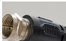
3 Companies Putting Big Cable Out Of