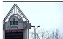
Restaurant Chain Plans in Place at the Centre